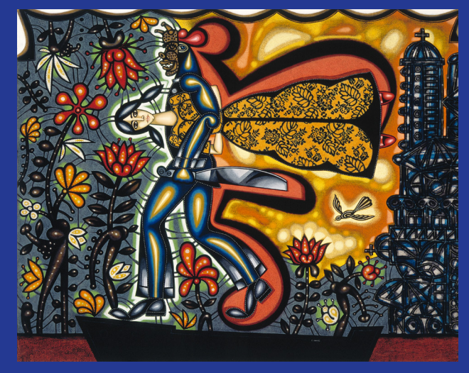
El rapto de la Catalina, 2001, oil on canvas, 63 x 78 3/4 in.

One of the most dynamic voices in contemporary Latin-American art today, Carlos Luna (American, b. in Cuba, 1969) will be the feature of a monographic exhibition at the Reading Public Museum this summer. The exhibition will be on view in the Meinig Family and World Cultures Galleries on The Museum's First Floor from June 3 through September 10, 2023. The exhibition will feature nearly 30 works that range from the late 1990s through his most recent productions.