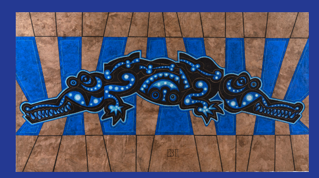
BI, 2019, gouache & charcoal on amate paper, 35 \frac{1}{2} \times 64 \frac{1}{2} in.

The artist has exhibited throughout the United States and Mexico, including solo exhibitions at The Bass Museum of Art, Miami, Florida; Museum of Latin American Art, Long Beach, California; The American University Art Museum at The Katzen Art Center, Washington, DC; The Patricia and Phillip Frost Art Museum at Florida International University, Miami, Florida; San Pedro Museo de Arte, Puebla, Mexico; and The Museum of Arts & Sciences, Daytona Beach, Florida.